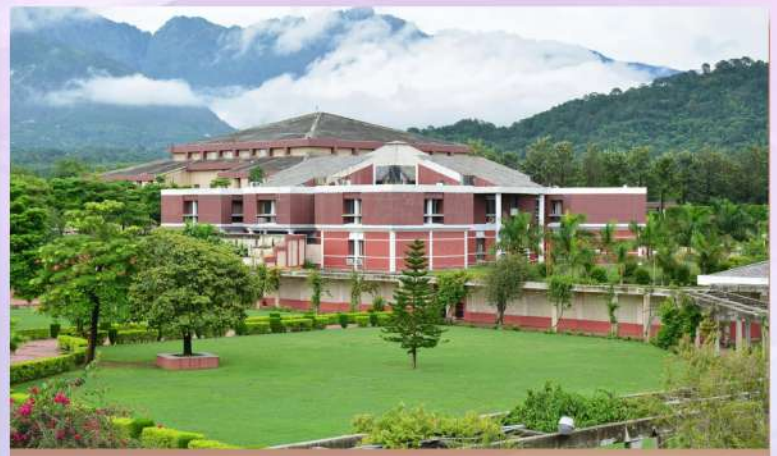
Lush Green Campus

How to reach ? Jammu is well connected by air, rail and road to major cities of country. Katra is connected by rail and road.