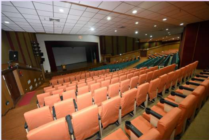
MAITRIKA - State of the art auditorium with capacity of 1000+